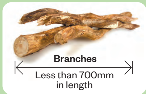
Branches Less than 700mm in length