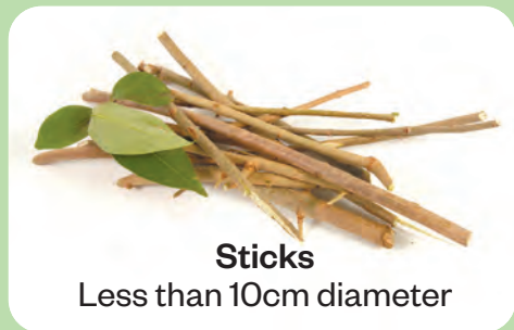
Sticks Less than 10cm diameter