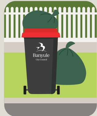
Bins with anything on top or leaning against or extra bags