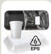
Expanded polystyrene containers