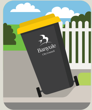
Bins on uneven ground