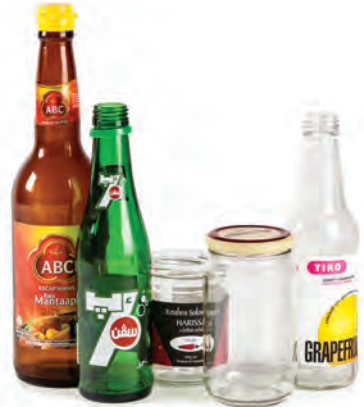
Glass bottles & jars