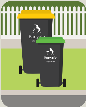
Bins next to or behind another bin