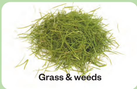
Grass & weeds