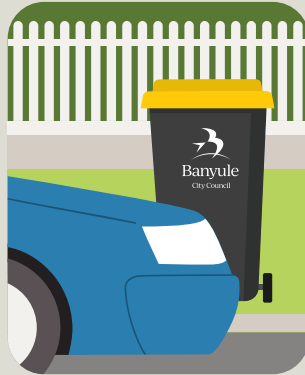
Bins behind a parked car