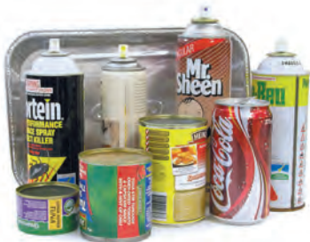
Aluminium & steel cans