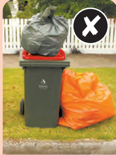
No extra bags will be collected