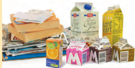
Paper, cardboard & cartons