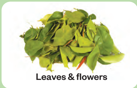
Leaves & flowers