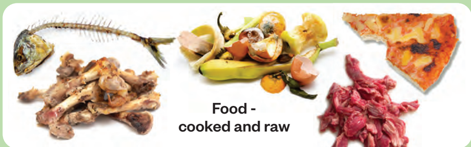
Food - cooked and raw