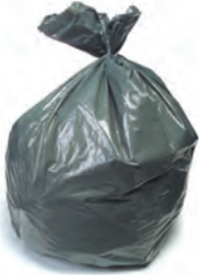
Bag or wrap rubbish