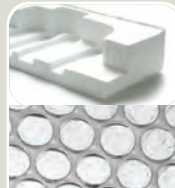
Expanded polystyrene & plastic wrap