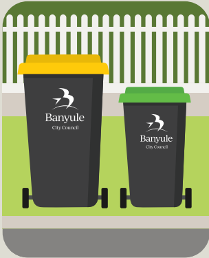
Bins too close together At least 30cm apart