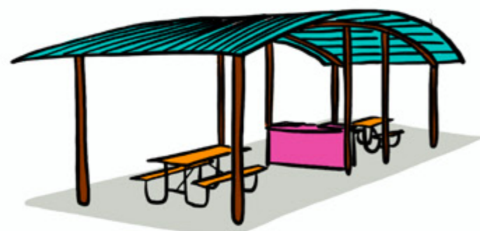
BBQ & PICNIC AREAS