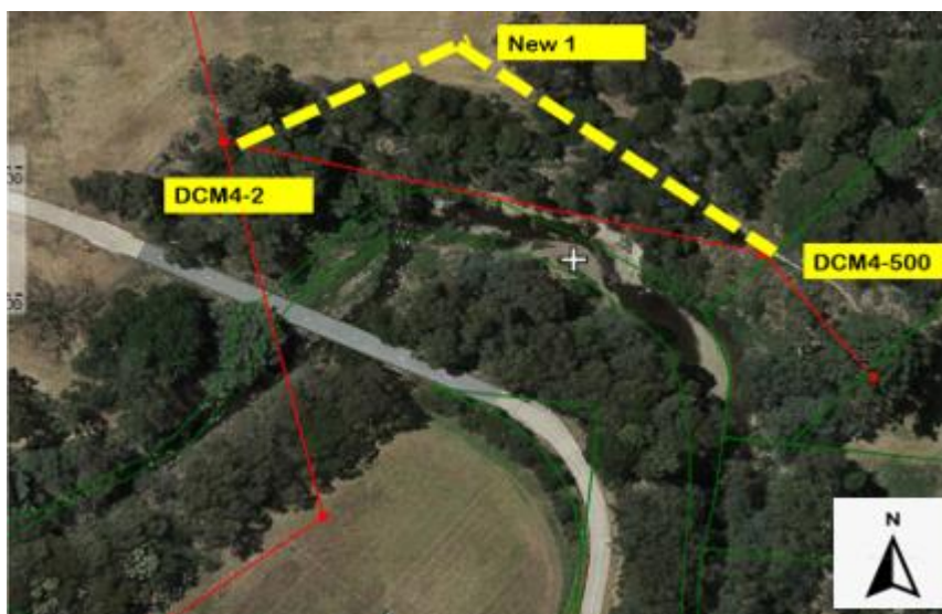
Figure 2: Proposed alignment of new sewer line shown yellow, existing shown red