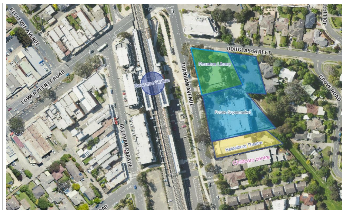
Figure 1 Locality Plan