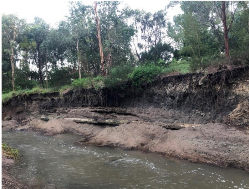
Figure 1: Exposed sewer pipe adjacent to Darebin Creek