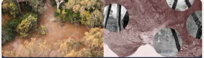
Image: Secret Stories in the Night Garden by Jutta Pryor. Banyule Art in Public Spaces program 2023

Get all the details and book an information session at banyule.vic.gov.au/ArtsProgram