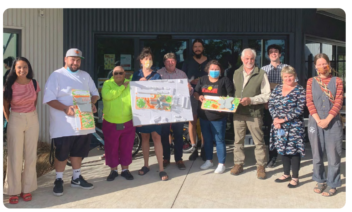
Members of community co-design team

Because of the central location, the Olympic Leisure Centre project promises to have a large positive ripple effect on the Olympic Village area. It will also improve physical connection and service offerings between the existing Olympic Village businesses and Banyule Community Health Service.