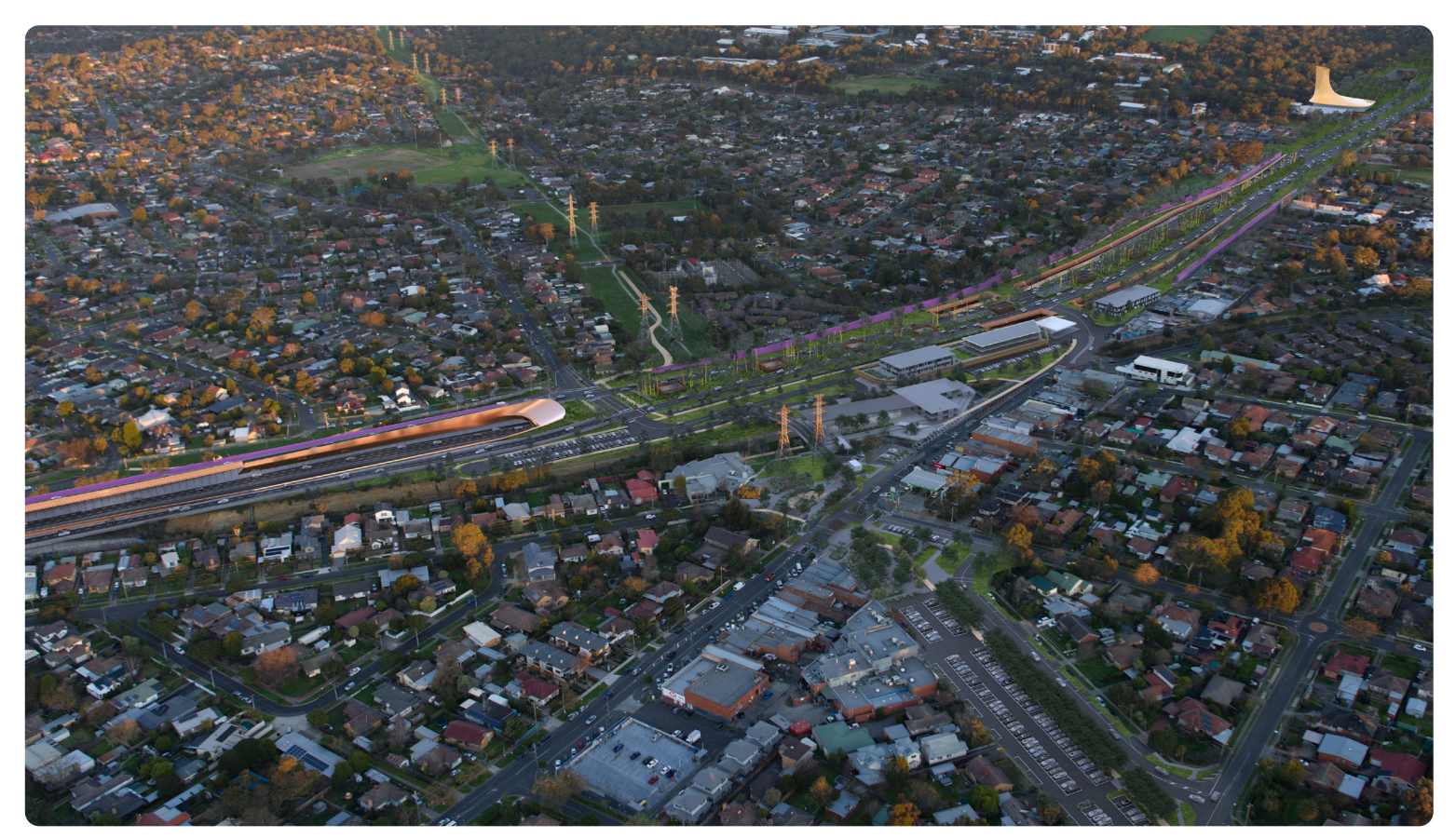
An artist's impression of how a green lid at Watsonia will connect the community

It also extends to the community's most vulnerable with the potential to create up to 750 new medium density dwellings and 160 affordable housing units.